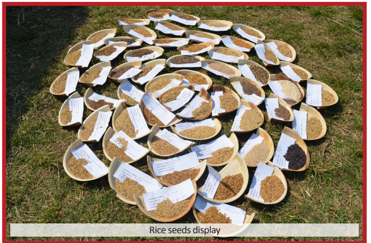
Rice seeds display