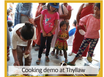
Cooking demo at Thyllaw