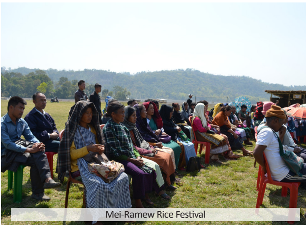
Mei-Ramew Rice Festival