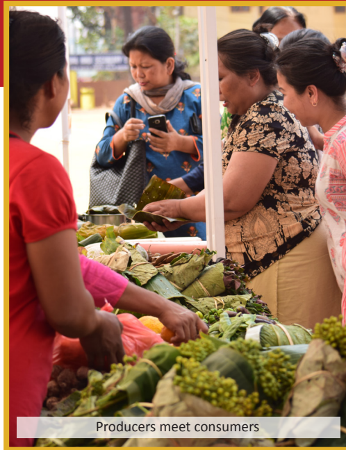
Producers meet consumers

This year's first Mei-Ramew Farmers' Market, the "Aman A•song Farmers' Market" was held on 15th March 2019 at Police Parade Groun, Tura, West Garo Hills.