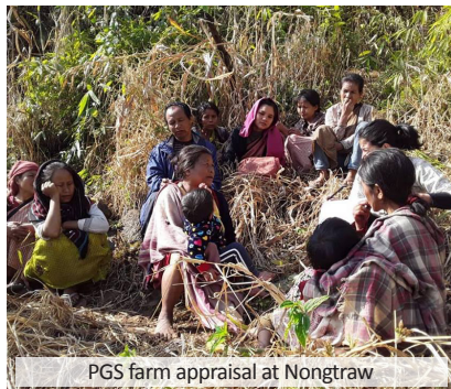
PGS farm appraisal at Nongtraw

44 PGS groups have been formed in 17 communities. Presently, the PGS groups are being trained on minutes keeping, selection of convener and collection of farm appraisal is still ongoing.