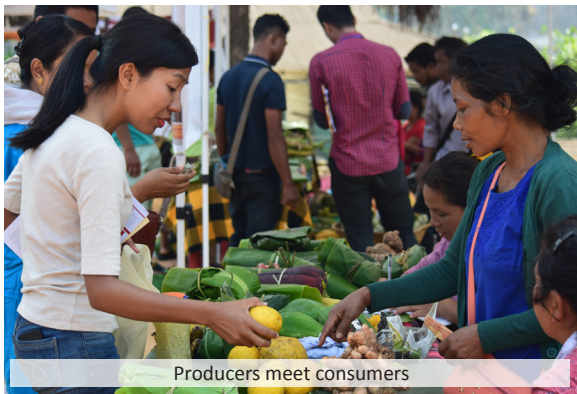
Producers meet consumers

The farmers from Dura Kantragre shared that the market is a real platform for them to get connected to consumers, and it was the first time they saw people taking importance in their vegetable produce.