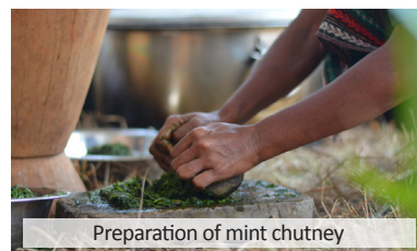
Preparation of mint chutney