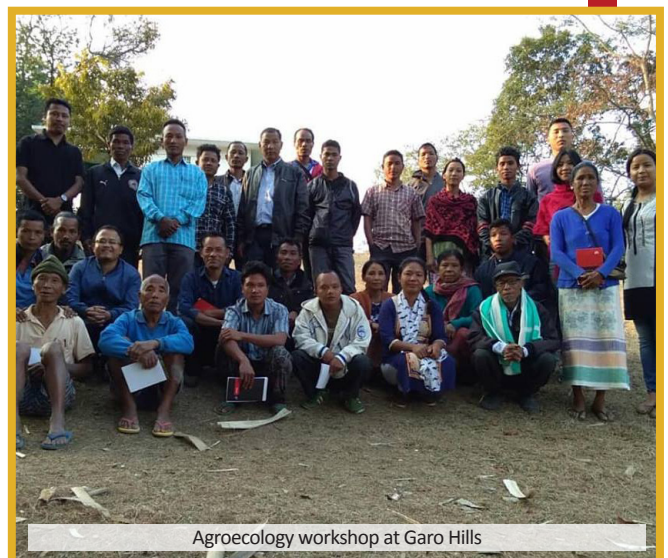
Agroecology workshop at Garo Hills