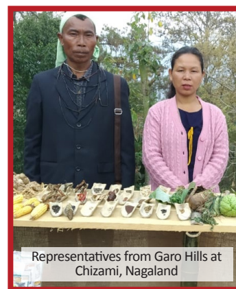
Representatives from Garo Hills at Chizami, Nagaland