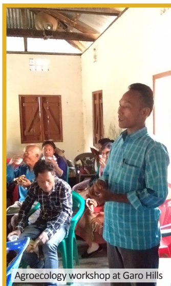
Agroecology workshop at Garo Hills