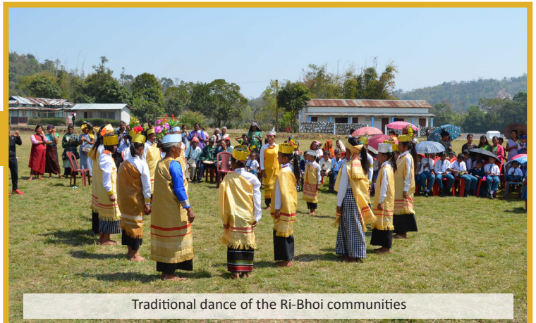
Traditional dance of the Ri-Bhoi communities

This event aimed to document and display the different indigenous varieties of rice from different communities who participated at the event. Around 58 varieties of rice seeds were brought together in one platform.