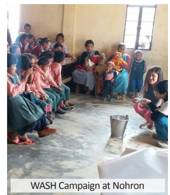
WASH Campaign at Nohron