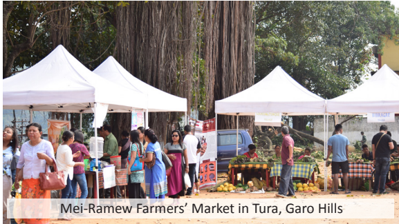
Mei-Ramew Farmers' Market in Tura, Garo Hills

This year's first Mei-Ramew Farmers' Market, the "Aman A•song Farmers' Market" was held on 15th March 2019 at Police Parade Groun, Tura, West Garo Hills.