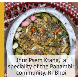
Jhur Psem Ktang, a speciality of the Pahambir community, Ri-Bhoi

NESFAS has recently started sharing indigenous recipes on its various social media handles and website. They have been specifically documented by the team from various events, food festivals and cooking demonstrations. Also, some of these have been contributed specifically by members of several communities and the NESFAS team has also shared the same with them so they can incorporate them in their mid-day meals and Integrated Child Development Services (ICDS) centres. These recipes have been developed using indigenous ingredients which are grown or foraged locally around Meghalaya.