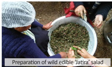
Preparation of wild edible 'Jatira' salad

The event was organised by the State Council of Science, Technology & Environment (SCSTE), Meghalaya in Collaboration with the North Eastern Council, Meghalaya Basin Development Authority, Bio-Resource Development Centre and National Innovation Foundation – India.