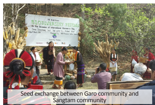
Seed exchange between Garo community and Sangtam community