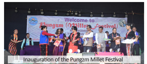
Inauguration of the Pungzm Millet Festival