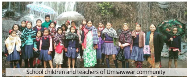
School children and teachers of Umsawwar community

The campaigns on Nutrition and WASH through the community programmes started in March 2019. Interns from Women's College, Martin Luther Christian University and Assam Don Bosco University, Dept of Social Work were also part of these programmes.