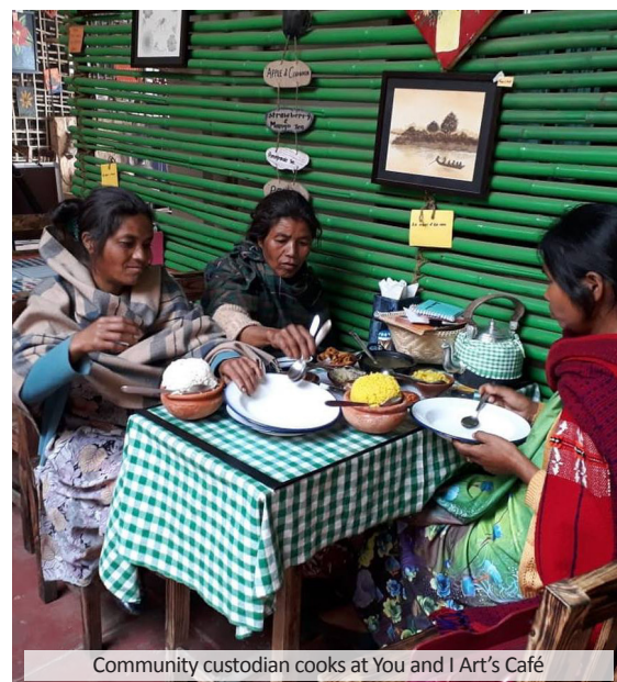
Community custodian cooks at You and I Art's Café