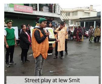
Street play at ĩew Smit