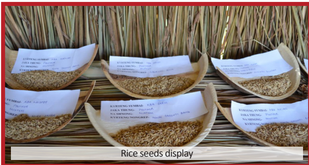
Rice seeds display