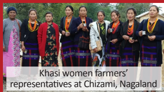
Khasi women farmers' representatives at Chizami, Nagaland