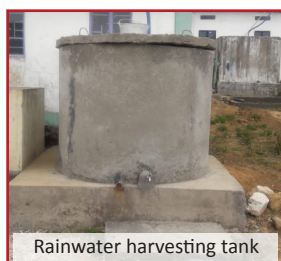
Rainwater harvesting tank

A low cost rain water harvesting has been completed in Laitsohpliah community, East Khasi Hills with technical assistance from State Council of Science Technology and Environment (SCSTE).