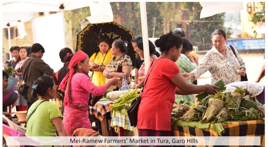
Mei-Ramew Farmers' Market in Tura, Garo Hills

Participating communities include Dura Kantragre, Darechikgre, Wakingrongre, and Bibragre from West Garo Hills, Rongram Block.