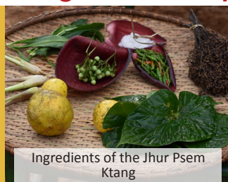
Ingredients of the Jhur Psem Ktang

NESFAS has recently started sharing indigenous recipes on its various social media handles and website. They have been specifically documented by the team from various events, food festivals and cooking demonstrations. Also, some of these have been contributed specifically by members of several communities and the NESFAS team has also shared the same with them so they can incorporate them in their mid-day meals and Integrated Child Development Services (ICDS) centres. These recipes have been developed using indigenous ingredients which are grown or foraged locally around Meghalaya.