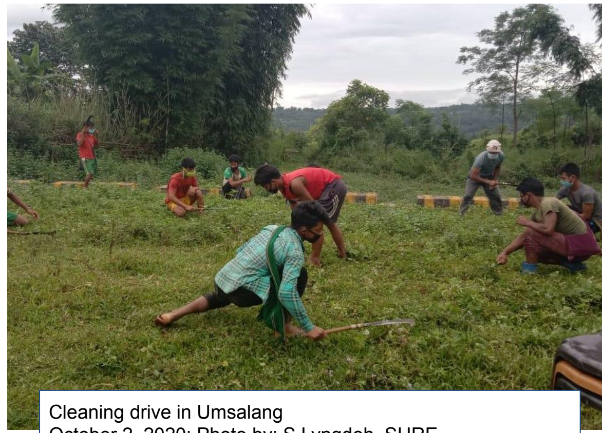
Cleaning drive in Umsalang October 2, 2020; Photo by: S Lyngdoh, SURE