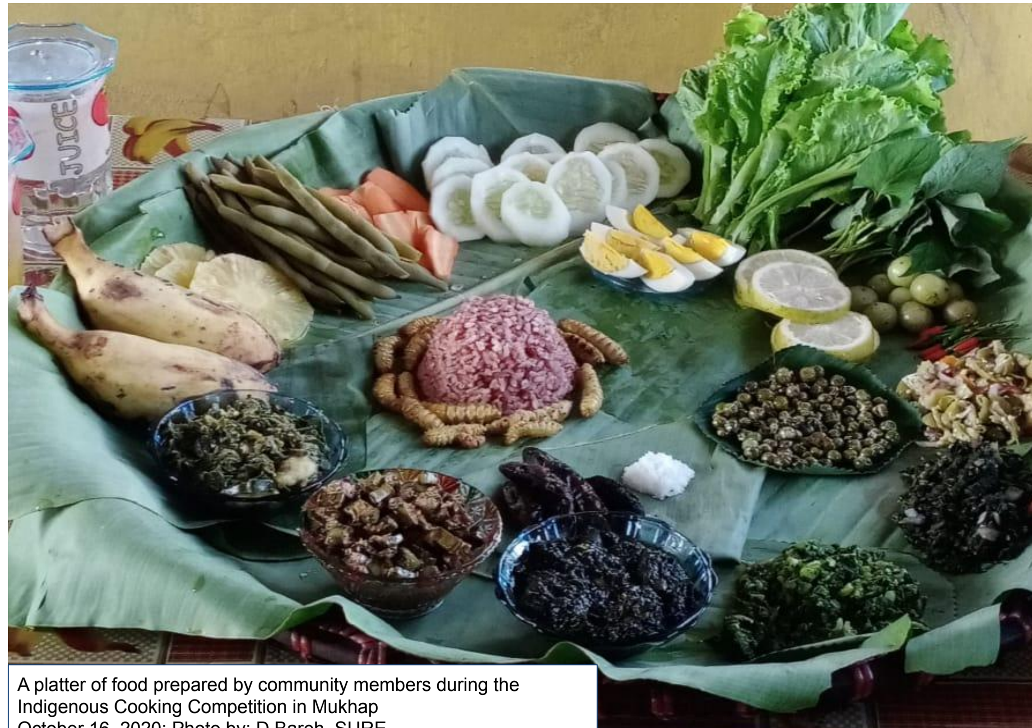
A platter of food prepared by community members during the Indigenous Cooking Competition in Mukhap October 16, 2020

Community members of Mukhap, West Jaintia Hills took part in an Indigenous Food Cooking Competition organised by NESFAS partner organisation Society for Urban and Rural Empowerment where they highlighted local and indigenous ingredients in their meals.