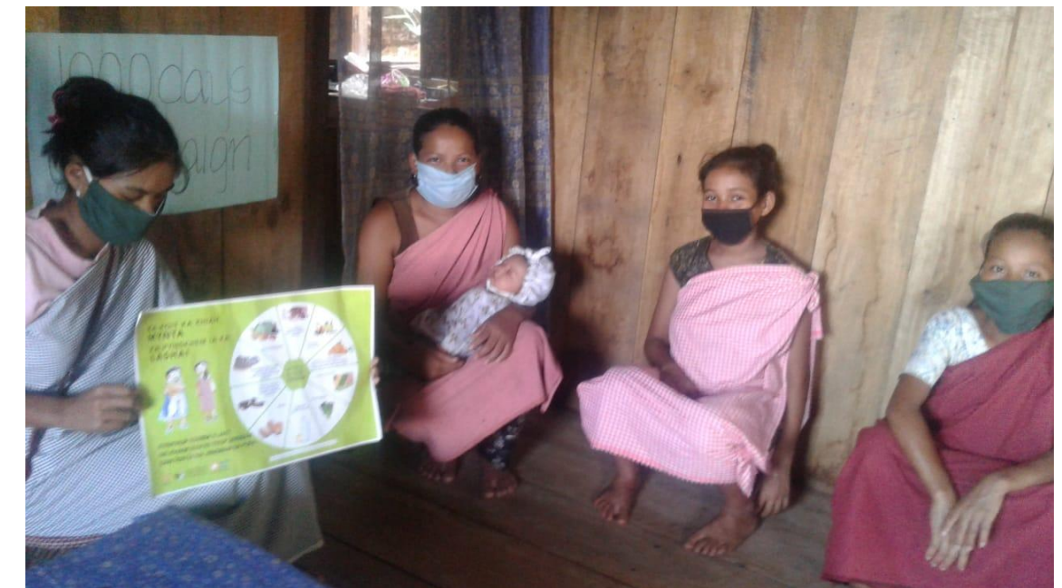
1000 Days campaign for pregnant women and lactating mothers at Nongpriang October 22, 2020; Photo by Saralin Suting