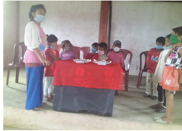
Nutritional campaign workshop held in Laitumiong October 15, 2020