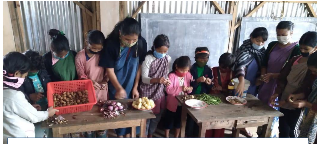
Nutritional campaign for children held in Nongwah October 9, 2020; Photo by Stialinda Khasain