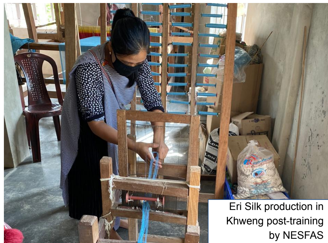
Eri Silk production in Khweng post-training by NESFAS Date: October 27, 2020