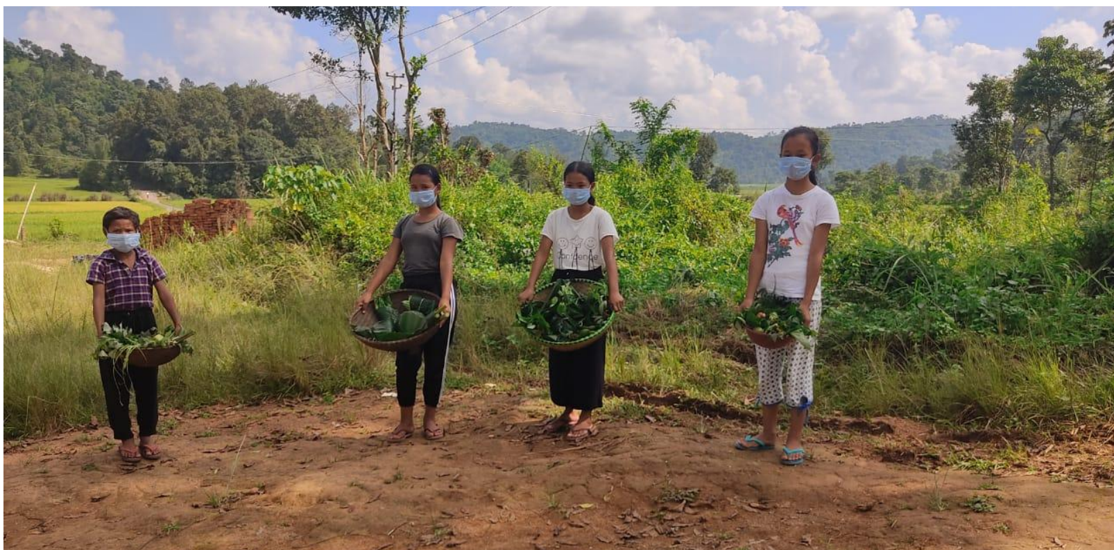
Agrobiodiversity Walk held on World Food Day in Madanritiang October 16, 2020; Photo by Naphishisha Nongsiej

In the month of October, our main focus was on World Food Day, which was celebrated globally on October 16, 2020. Several programmes were held across 27 communities. The highlight of the day was community members embracing the theme of the day - Grow, Nourish, Sustain. Together. The activities of the day included drawing competitions for the children; agrobiodiversity walks, cooking competitions where community members were asked to highlight local and chemical-free ingredients and workshops on food sovereignty. On the other hand, we also launched our Grassroots Journalism initiative wherein six identified youths will be trained to document stories from their respective and nearby communities.