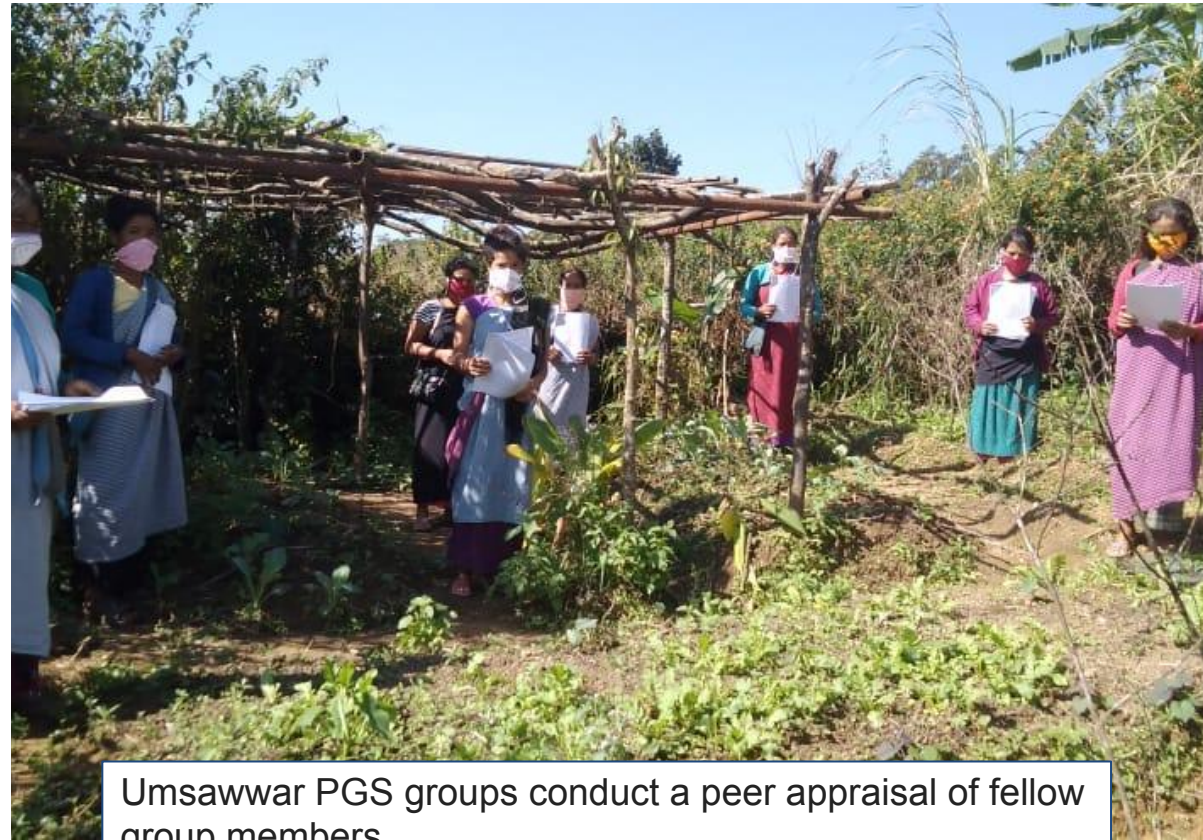
Umsawwar PGS groups conduct a peer appraisal of fellow group members October 30, 2020