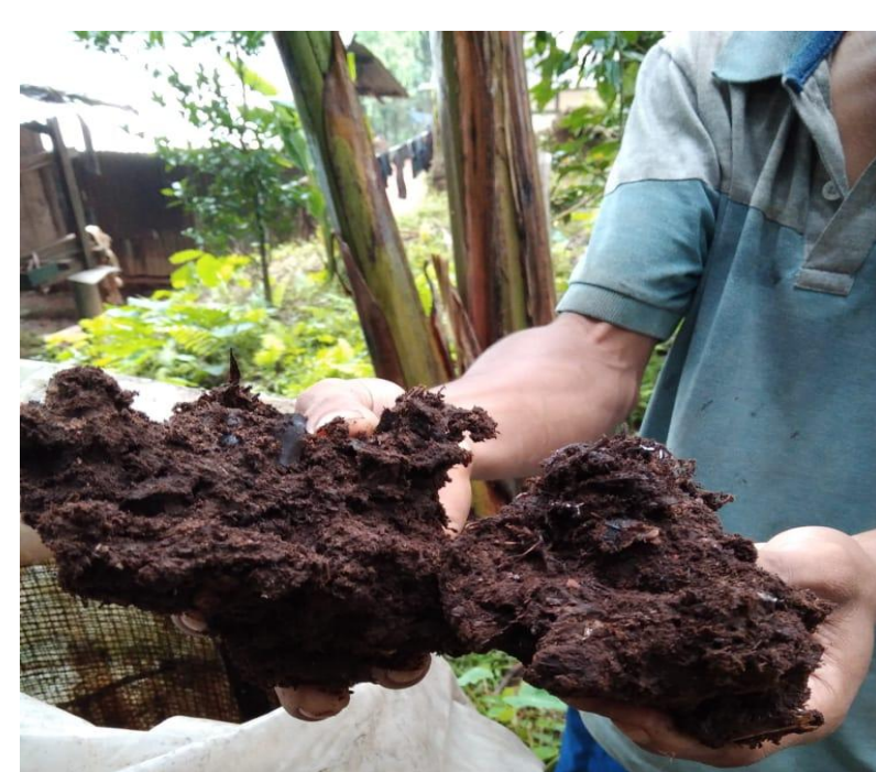
Berkeley compost made by the youth of Durakantragre community October 20, 2020; Photo by Alfred A Sangma