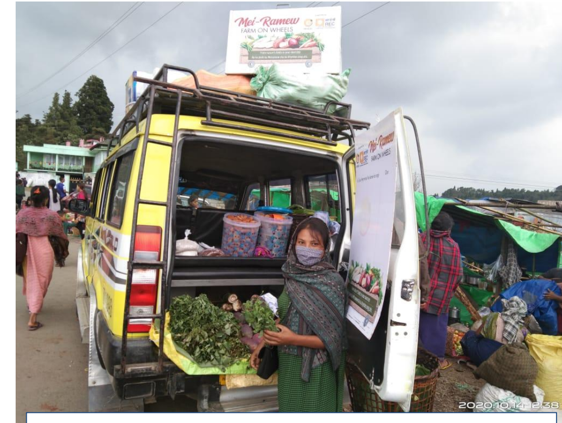
Farm on Wheels initiative by PGS farmers of Garo Hills October 23, 2020; Photo by Palnangson A Sangma