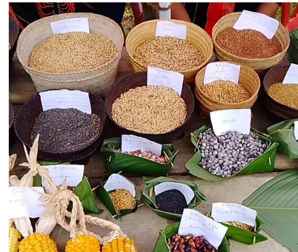
Seed Display at the community seed bank in Phor October 1, 2020; Photo by Vilazonuo Gloria, NEN