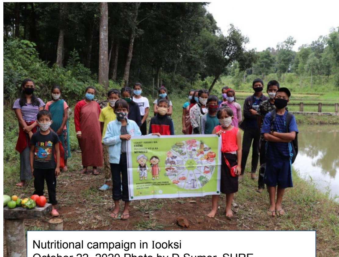
Nutritional campaign in Iooksi October 22, 2020