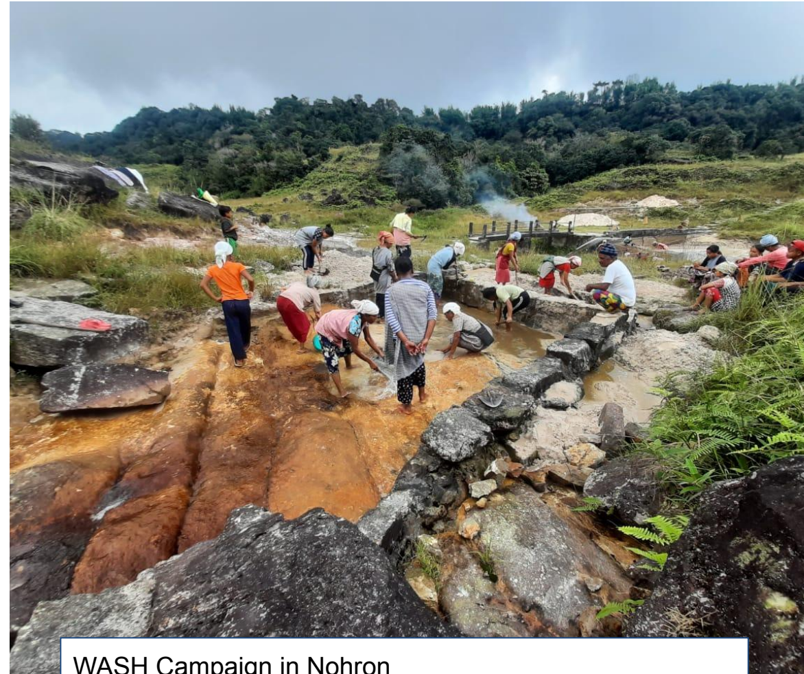
WASH Campaign in Nohron October 19, 2020