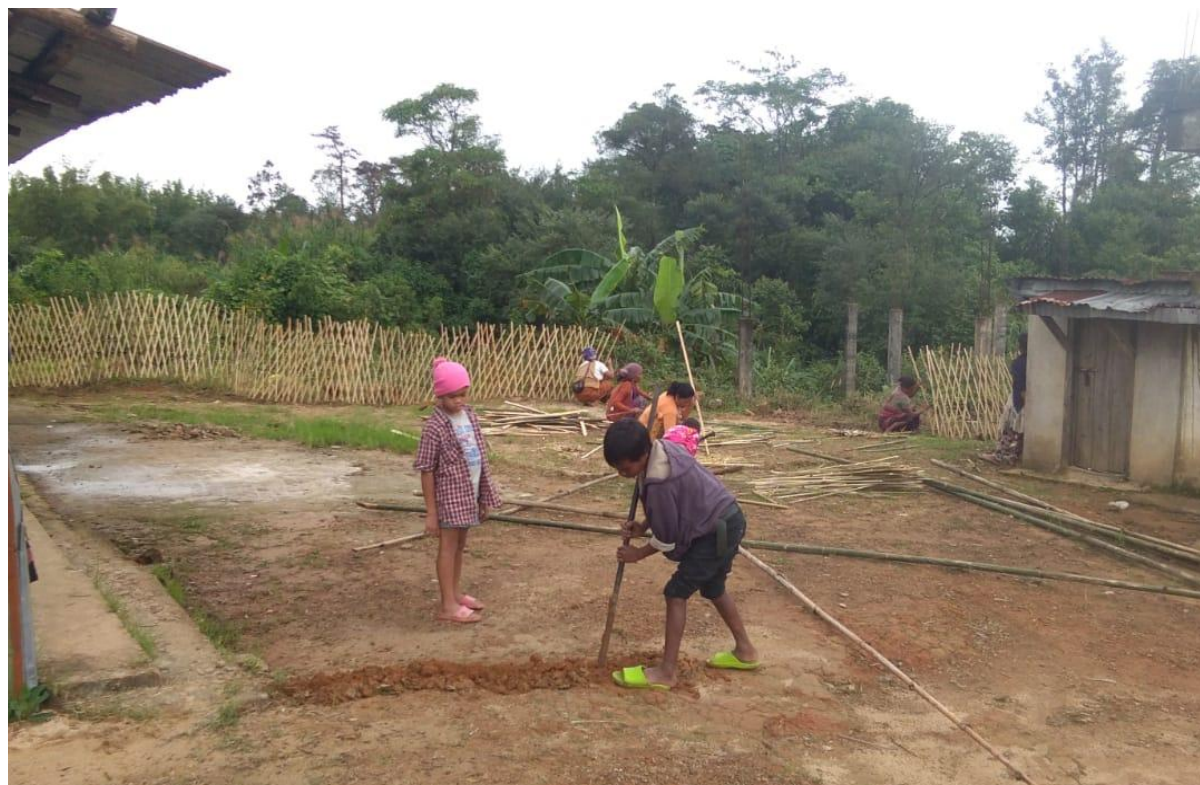
School garden fencing at SSA LP School, Wahshnong Cham Cham October 3, 2020