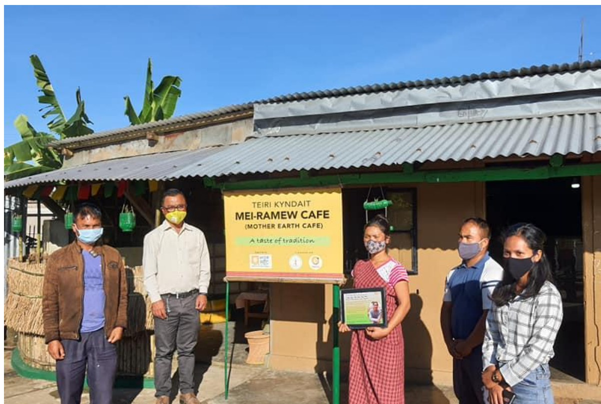
Inauguration of Mei-Ramew Cafe in Mupyut October 30, 2020; Photo by H Lyngdoh, SURE