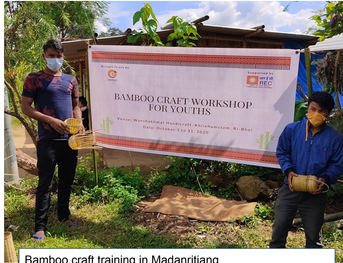
Bamboo craft training in Madanritiang October 8, 2020; Photo by Naphishisha Nongsiej