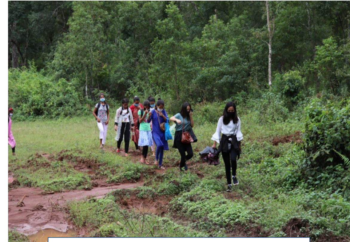
ABD walk held in Iooksi October 22, 2020