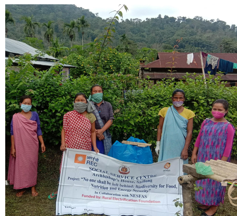
Workshop on Berkeley Composting held in Nongkhrah community October 27, 2020; Photo by Judit, SSC