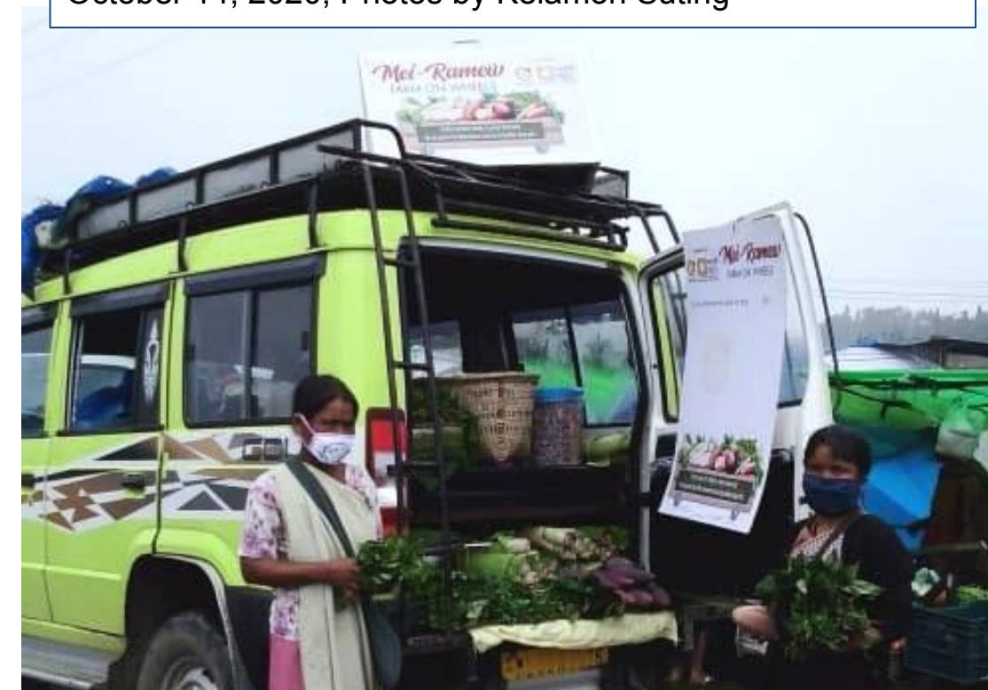
Farm on Wheels initiative by PGS farmers of Umsawwar October 14, 2020