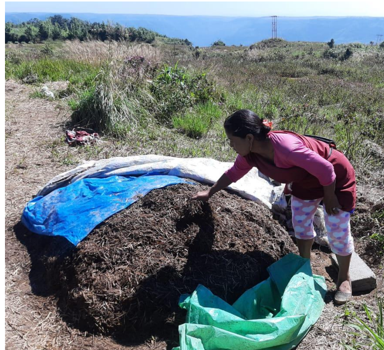
Berkeley compost training held in Nohron by the community members October 12, 2020; Photo by Jimson Lyting