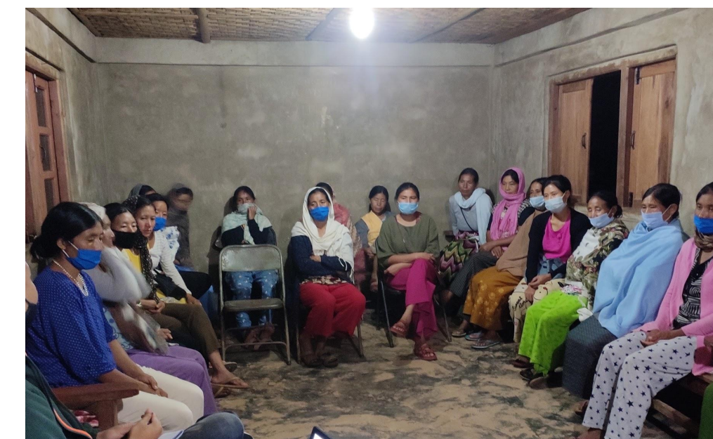
ALC members of Phor attend a Millet Charter meeting October 9, 2020