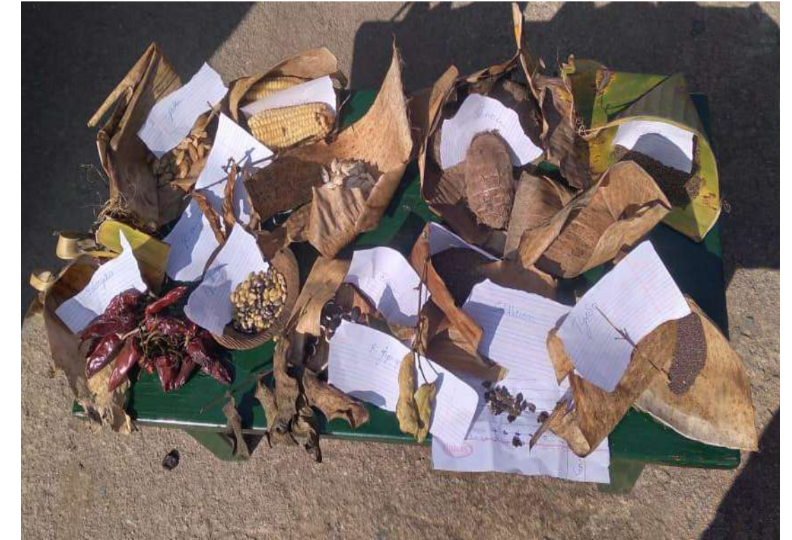
Seeds exchange between PGS & ALC groups at Nongwah February 16, 2021