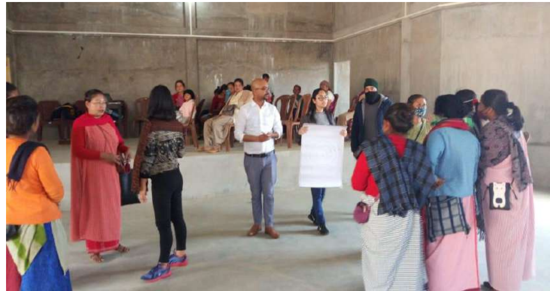
Community Level basic business management workshop at Mulum February 19, 2021