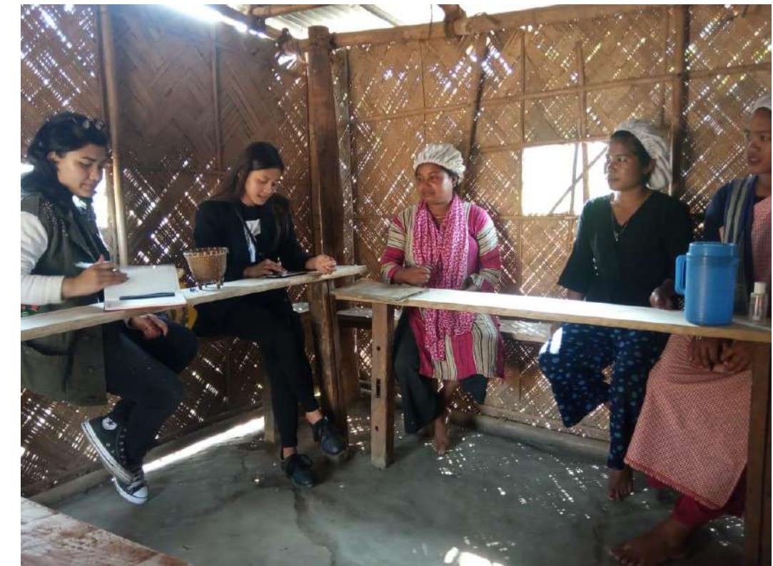
Value chain evaluation of Mei-Ramew Cafe February 2, 2021