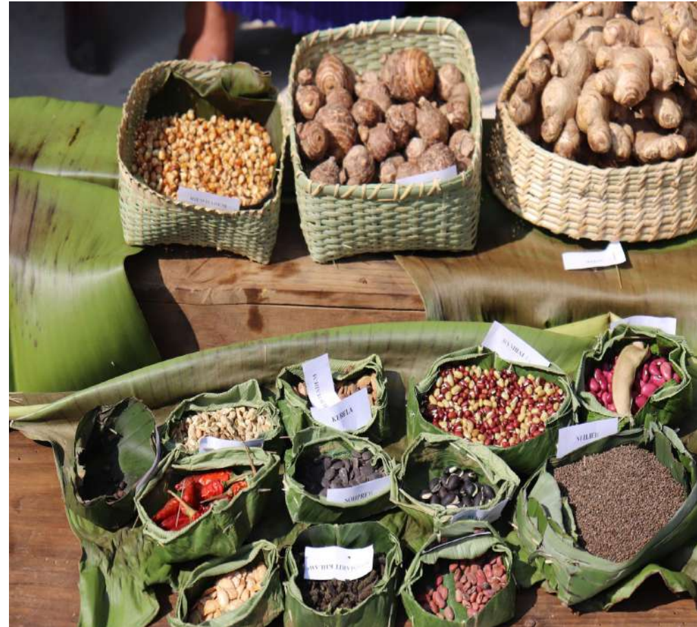
Inter-village community seed fair cum seeds display & exposure visit at Nongtraw February 18, 2021