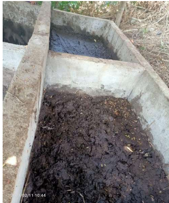
Vermi Composting unit at Belukri February 2, 2010