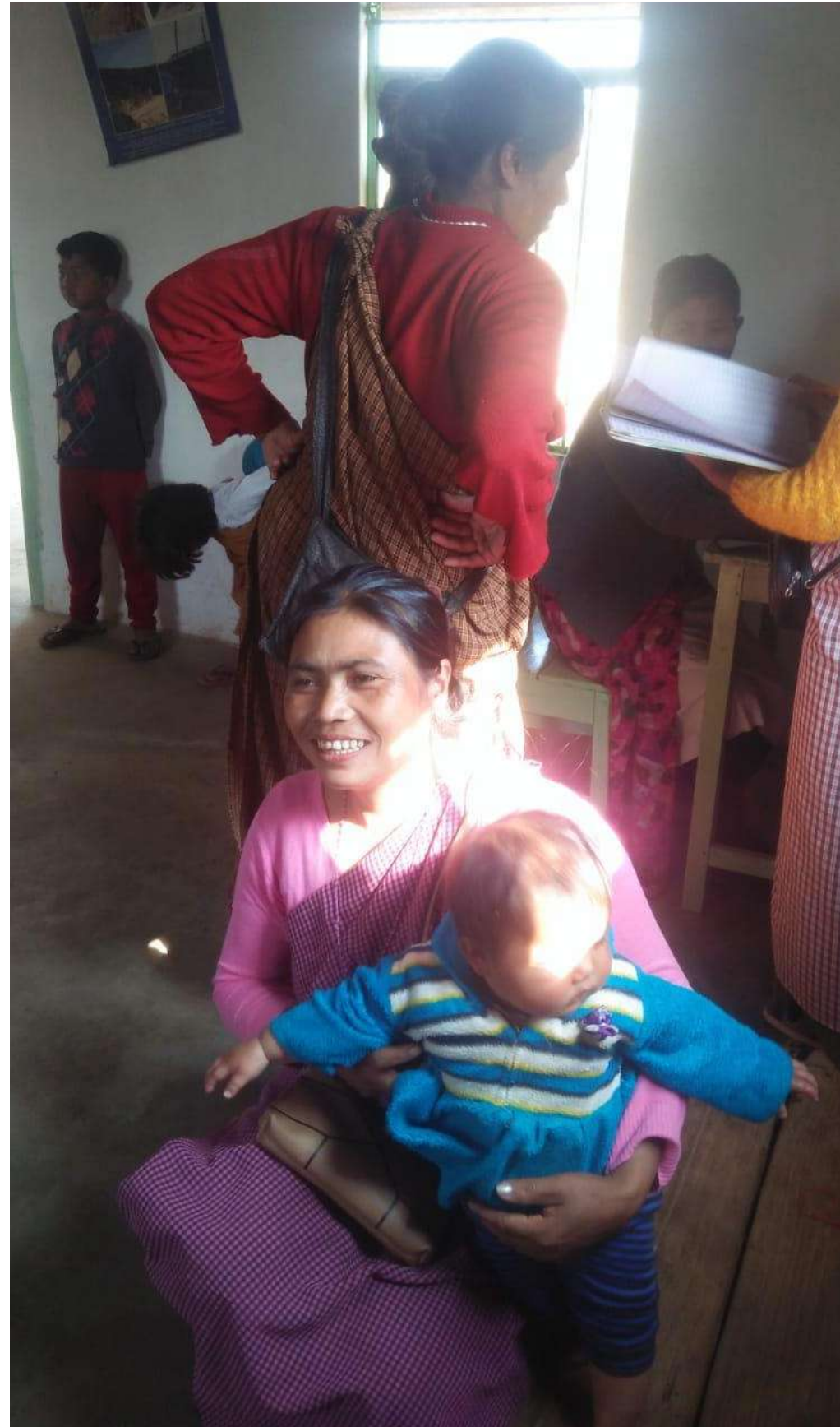
Health check-up for children February 8, 2021; Photo by SURE