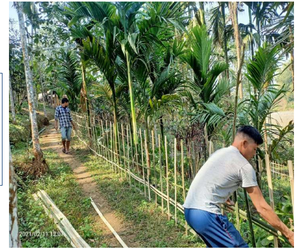
Setting up of Biodiversity Garden at Marmain February 2, 2010; Photo by SSC