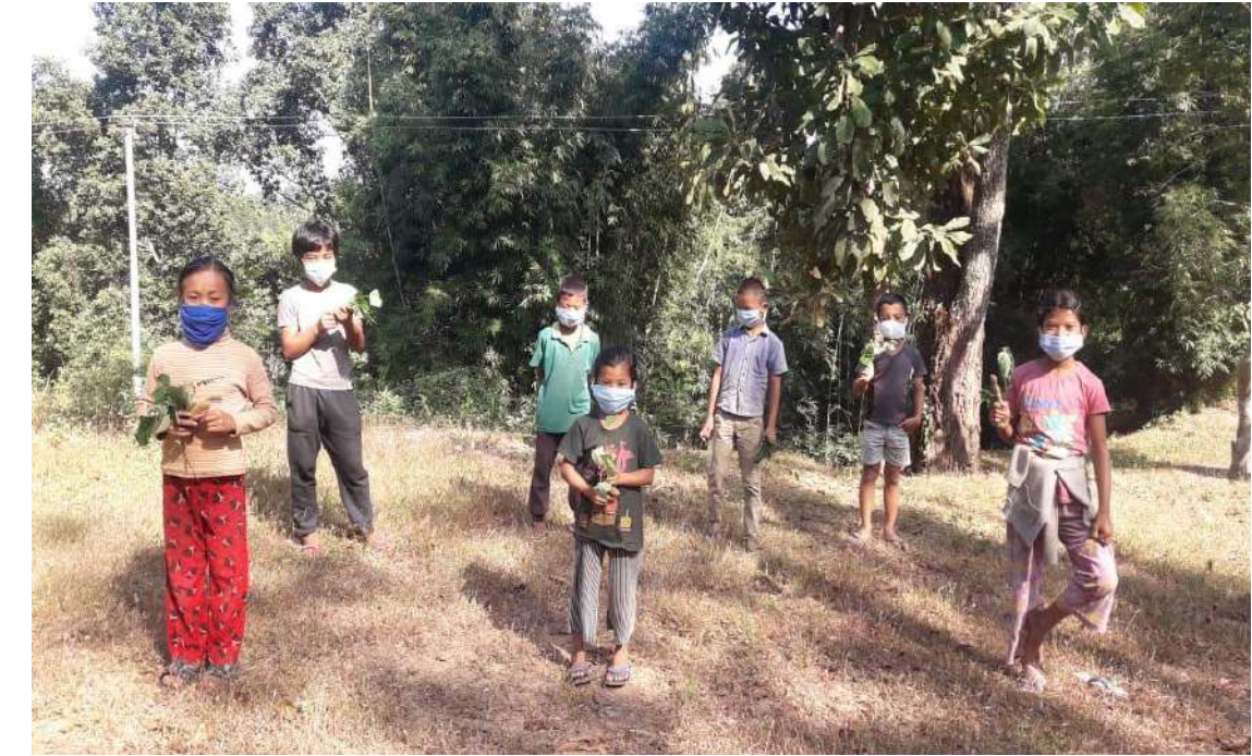
ABD Walk in Samingre February 25, 2021