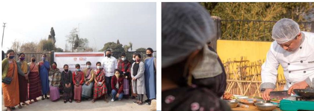
Nutrition campaign for Mid-day Meal cooks at Nongwah February 12 , 2021