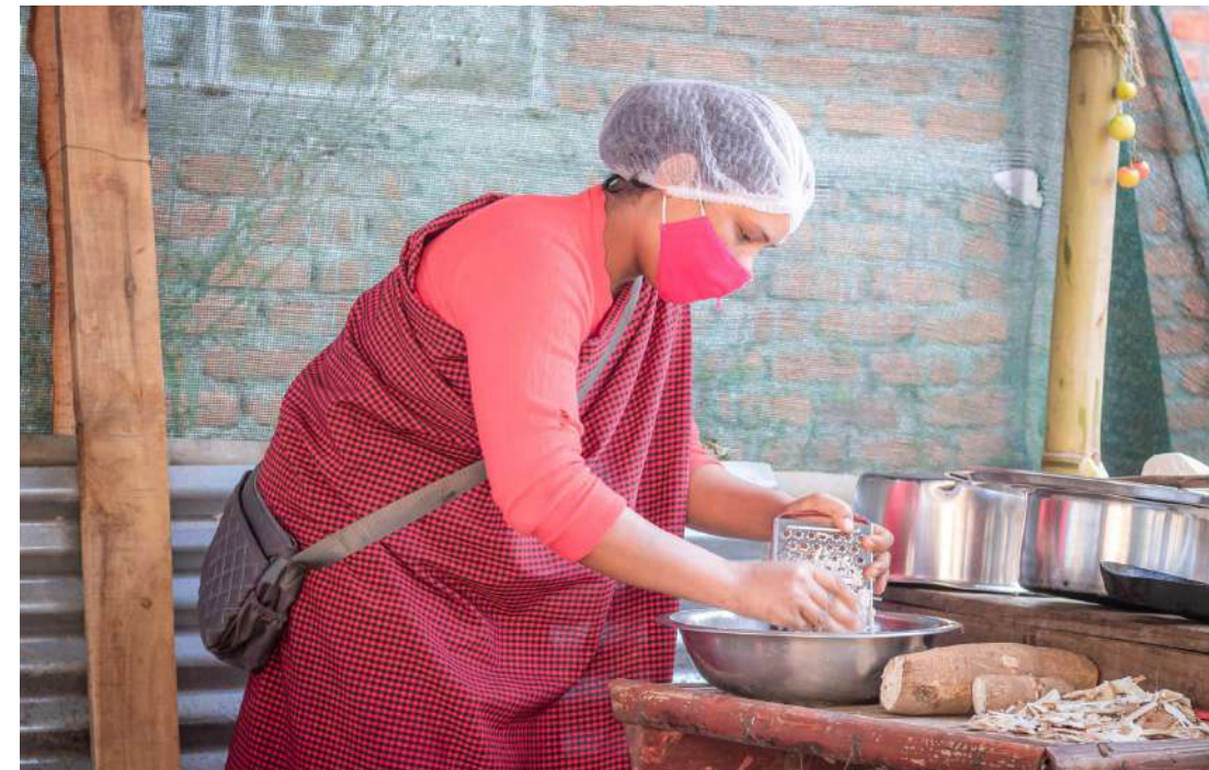
Capacity building workshop for the Mei-Ramew Cafe Cooks at Khweng February 8 -10, 2021