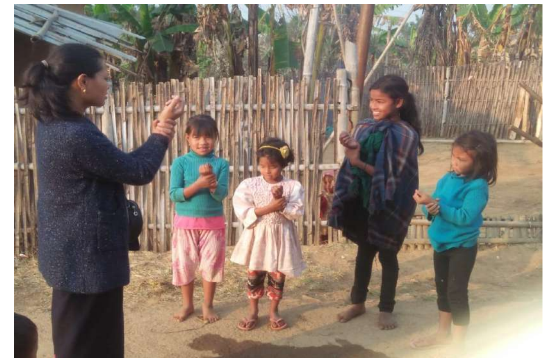
WASH Campaign at Nongkroh February 9, 2021